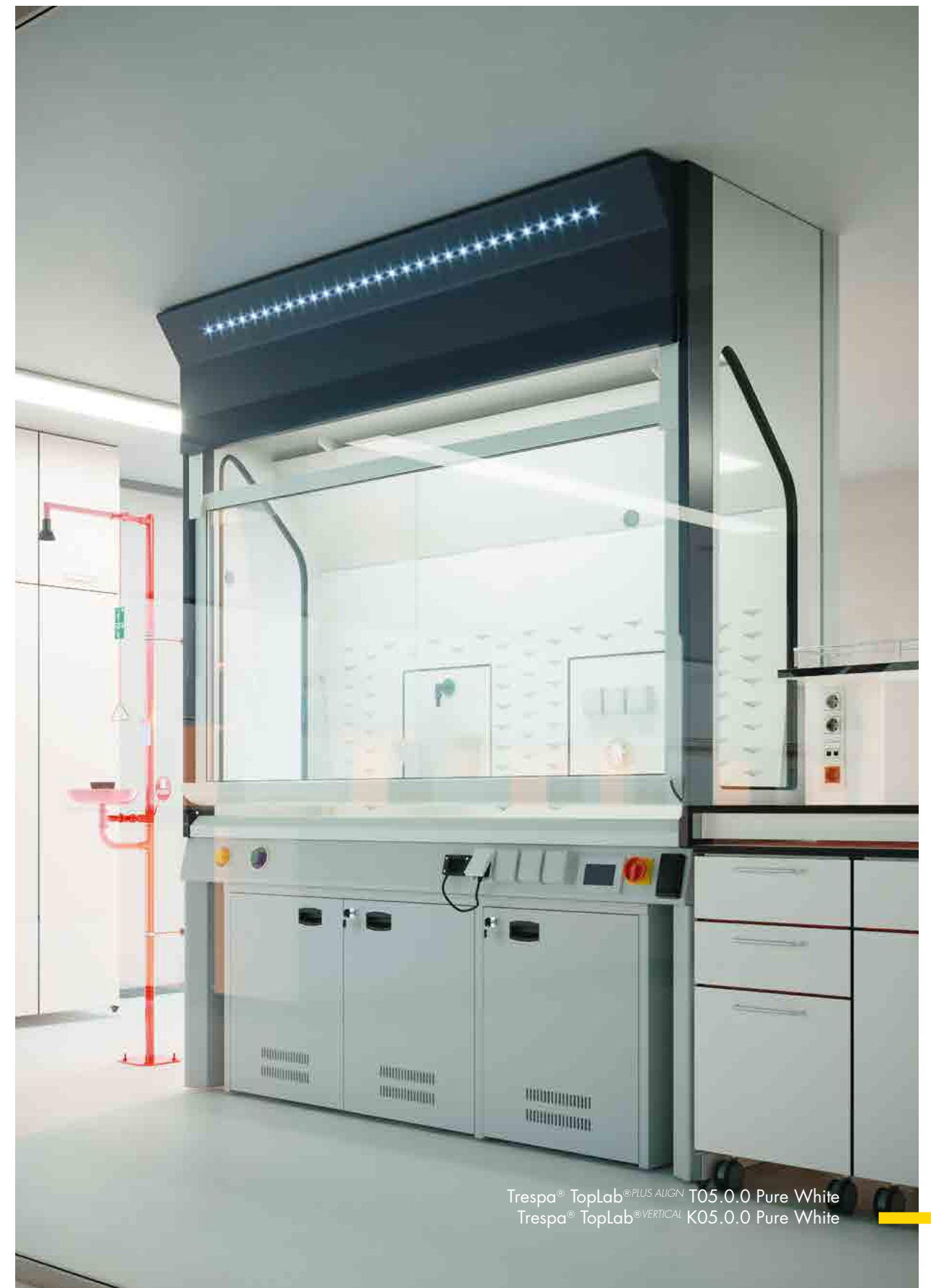
Trespa® TopLab® PLUS ALIGN T05.0.0 Pure White Trespa® TopLab® VERTICAL K05.0.0 Pure White